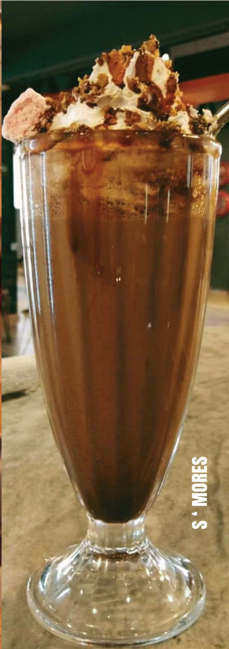
S ' MORES