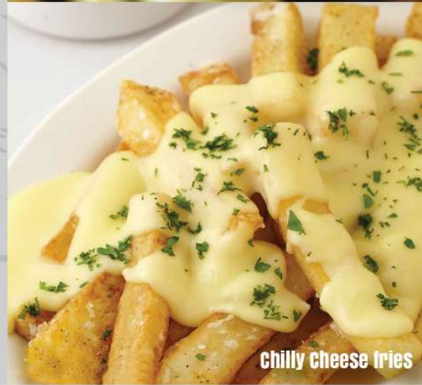
chilly cheese fries