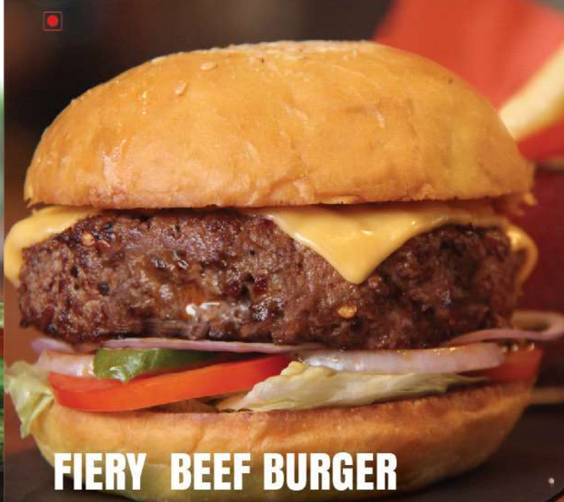
FIERY BEEF BURGER