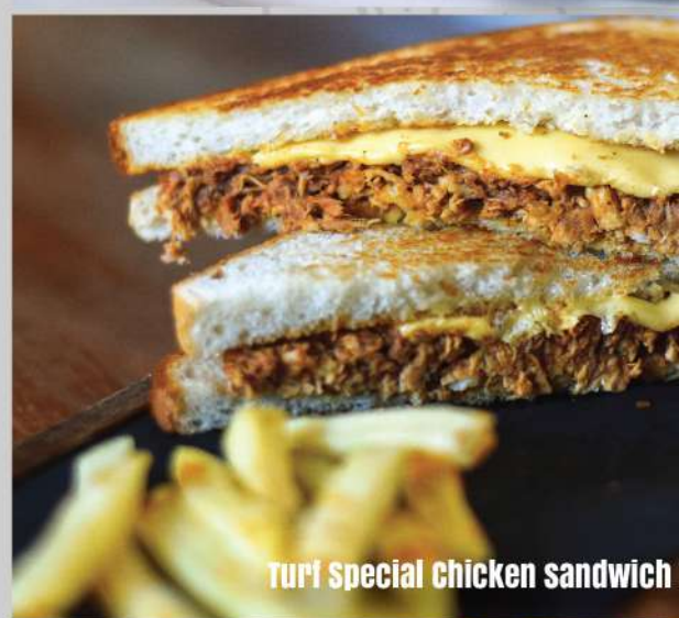
turf special chicken sandwich