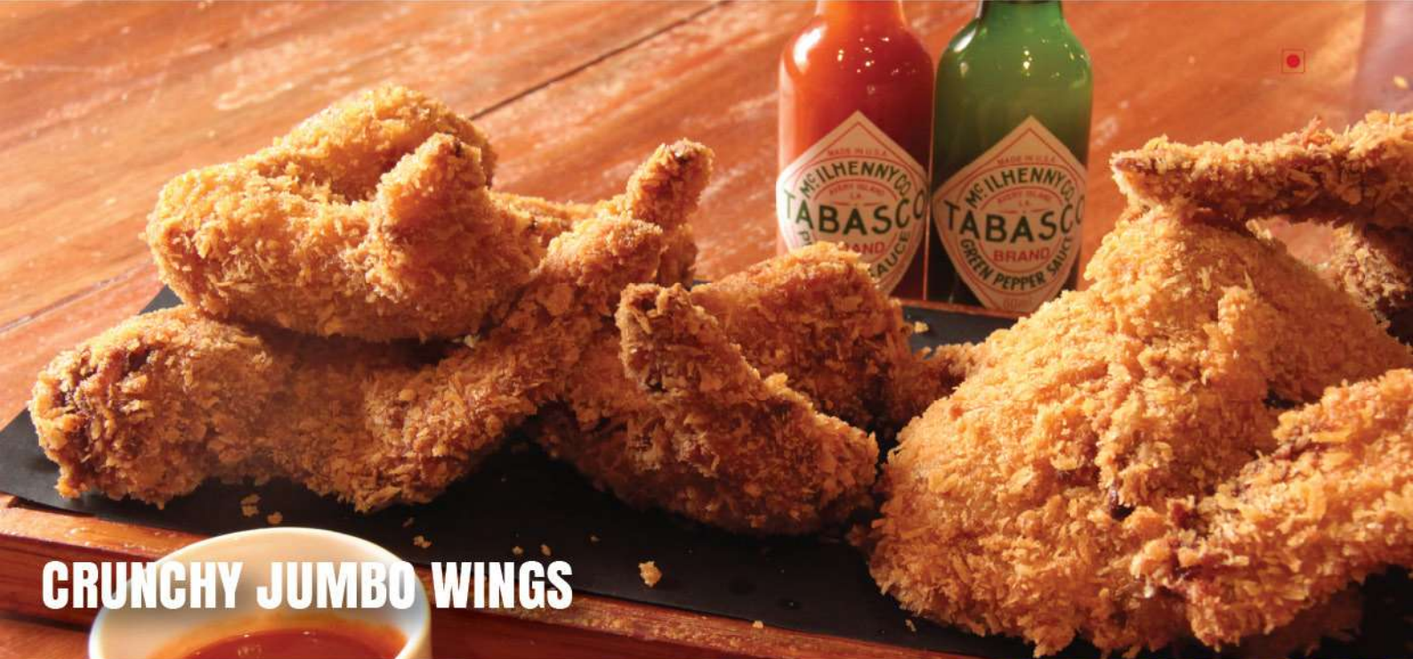
CRUNCHY JUMBO WINGS