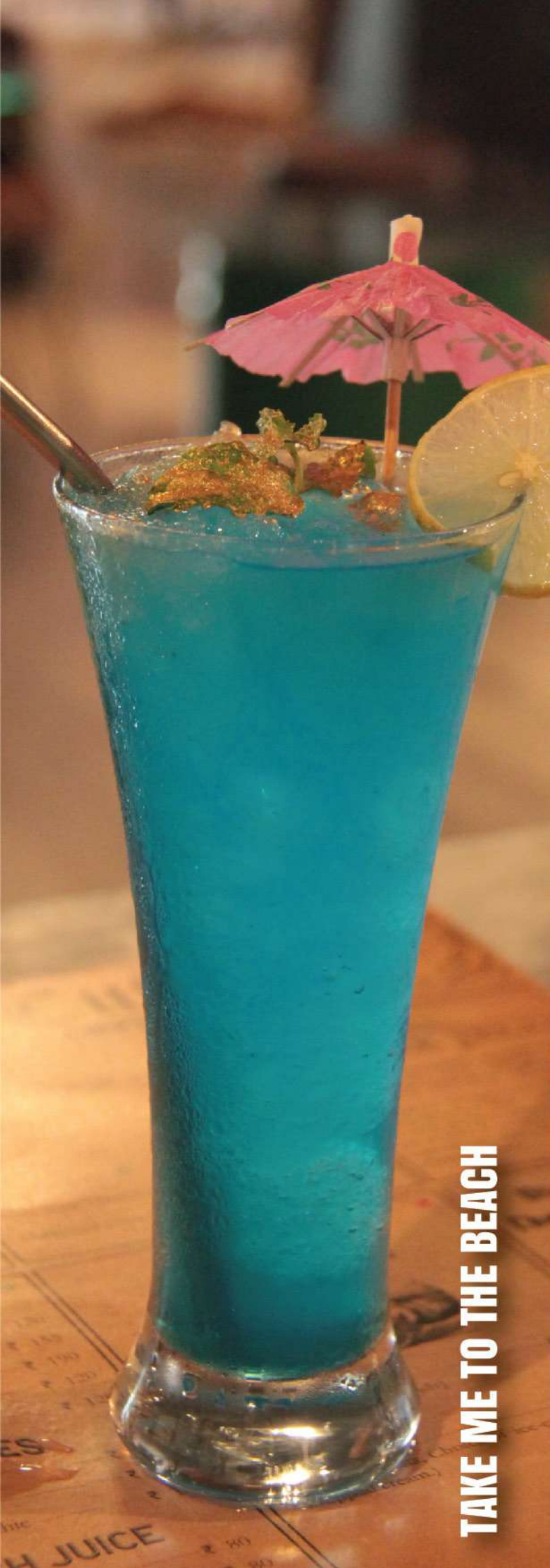
TAKE ME TO THE BEACH