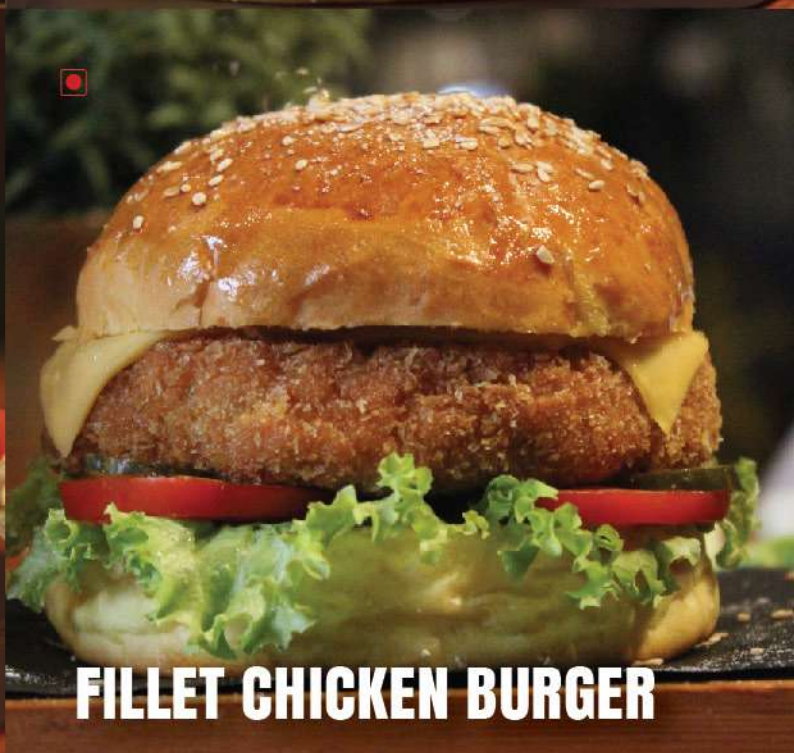
FILLET CHICKEN BURGER