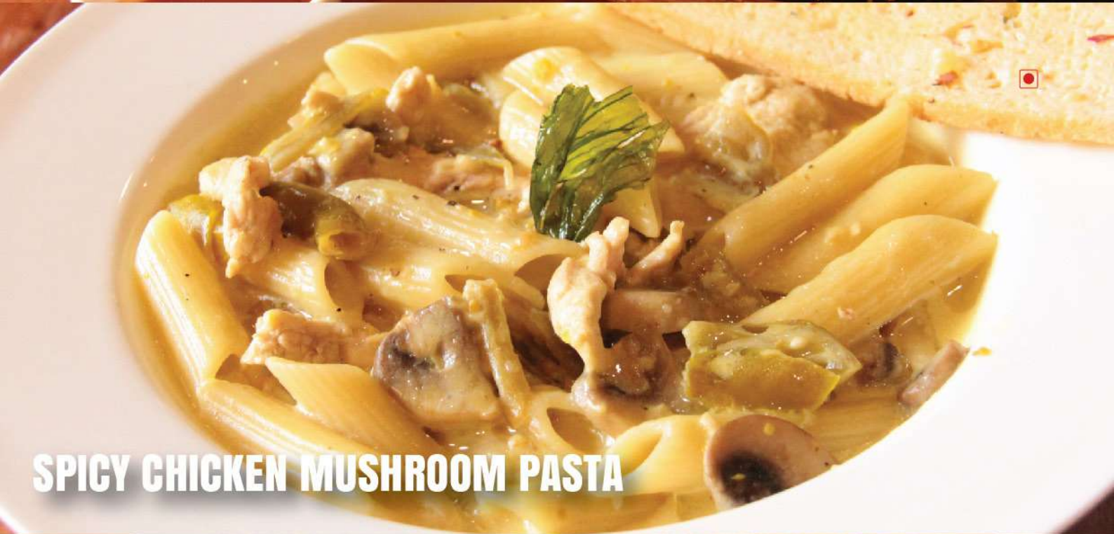
SPICY CHICKEN MUSHROOM PASTA