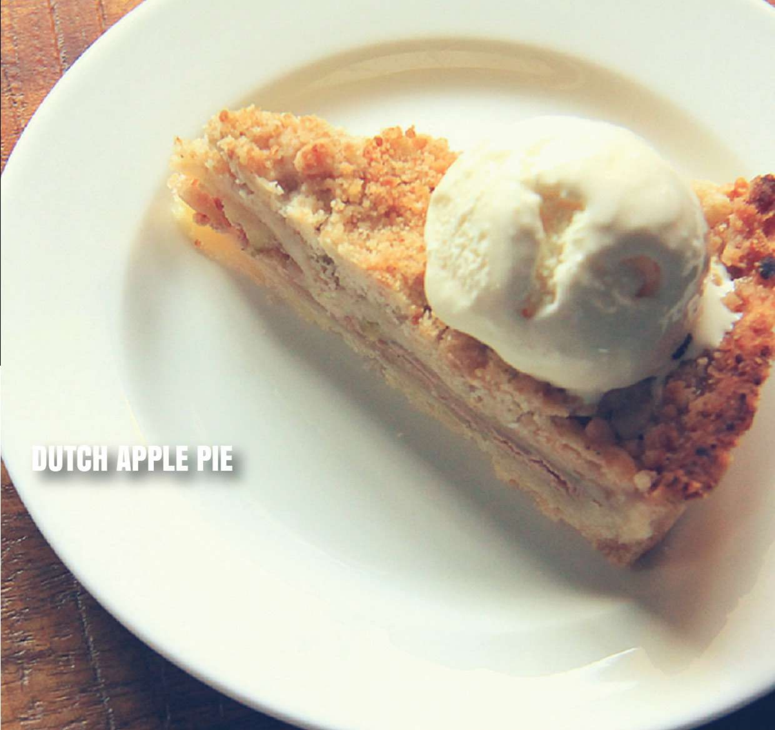
DUTCH APPLE PIE