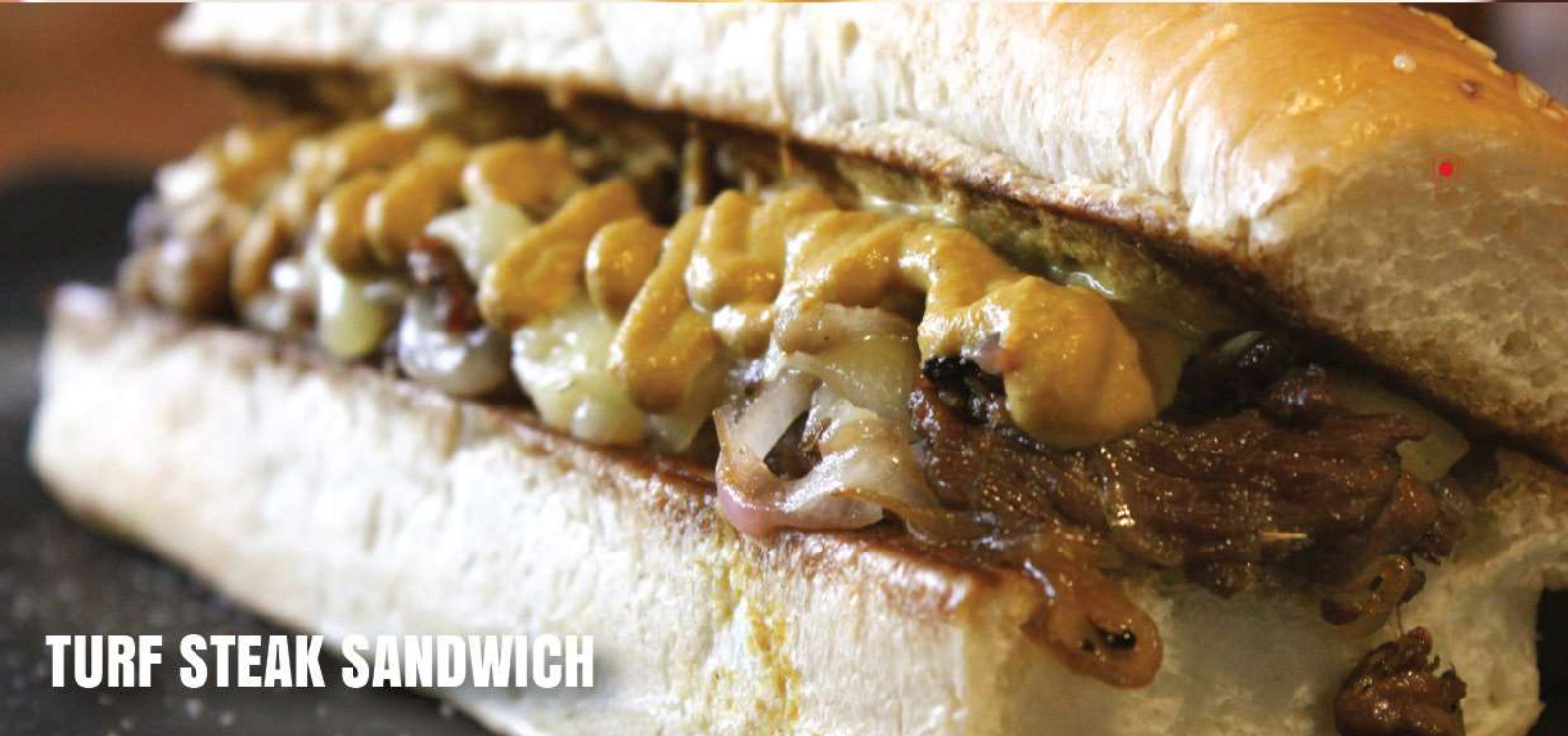
TURF STEAK SANDWICH