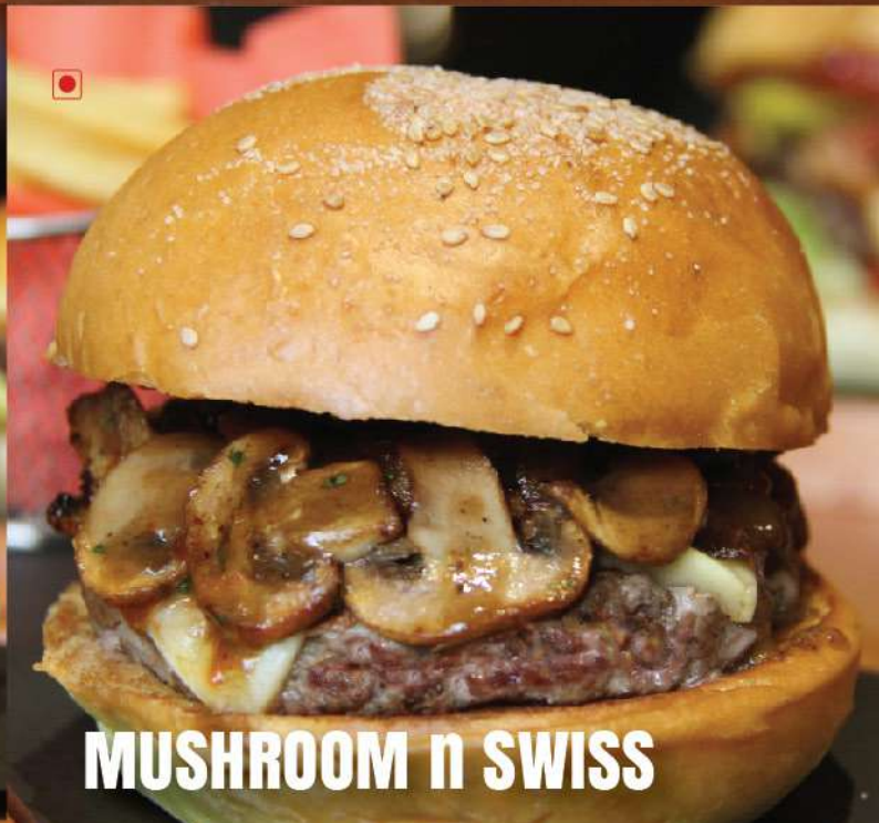
MUSHROOM n SWISS