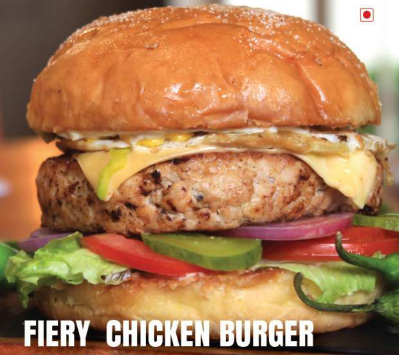
FIERY CHICKEN BURGER