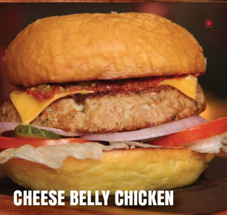
CHEESE BELLY CHICKEN