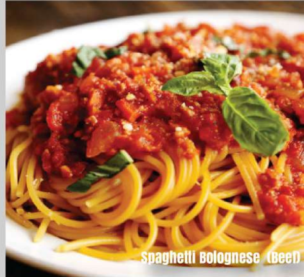
Spaghetti Bolognese (Beef)

(Healthy mixture of grilled chicken and roasted vegetables sauteed in virgin olive oil and seasoned with fresh herbs)