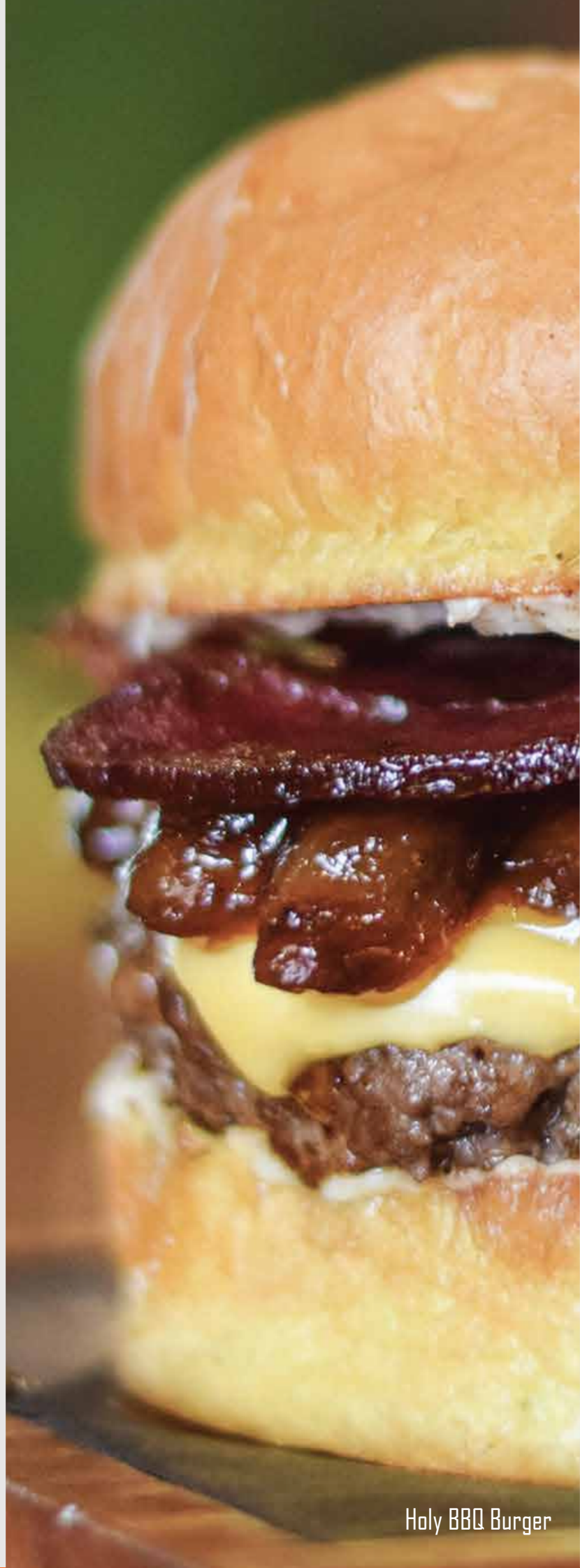
Holy BBQ Burger

(Griddled double beef patty, beef bacon, mushroom ragout, iceberg lettuce, tomatoes, gherkins, double cheddar cheese with in-house mayo)