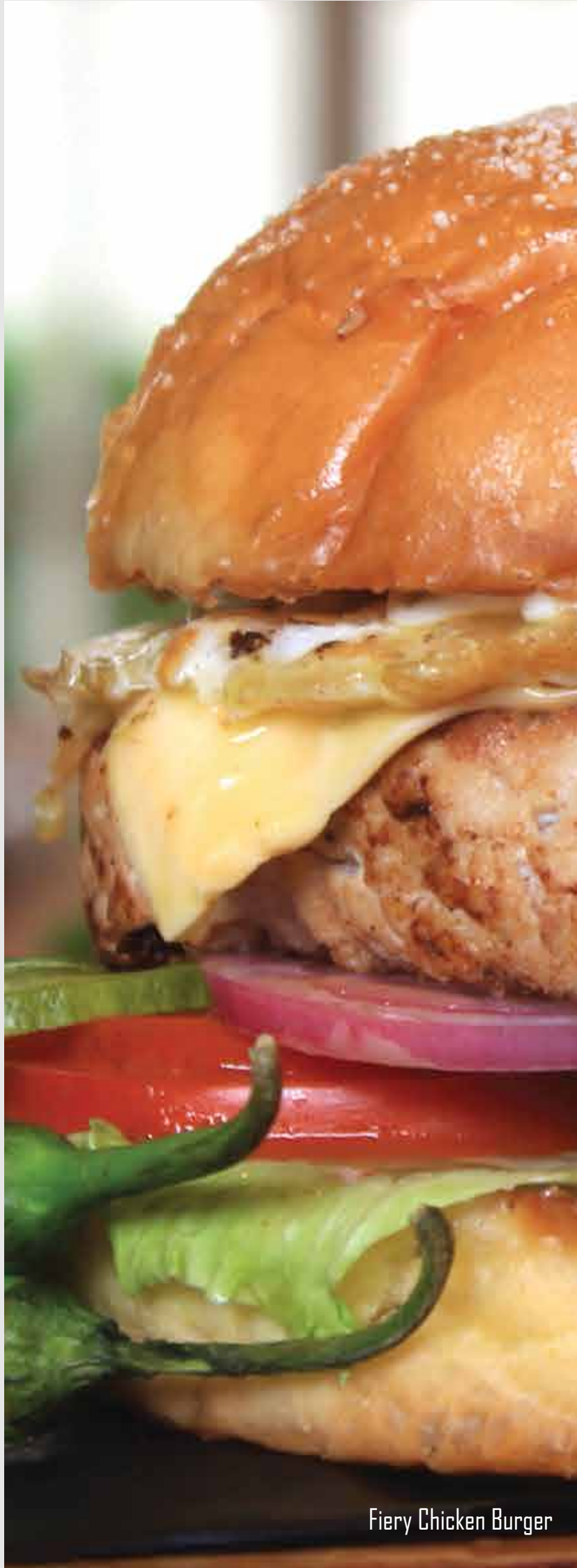
Fiery Chicken Burger

(Cheesy griddled chicken patty, iceberg lettuce, tomato, onion, gherkins, chipotle salsa, guacamole salsa with in-house mayo)