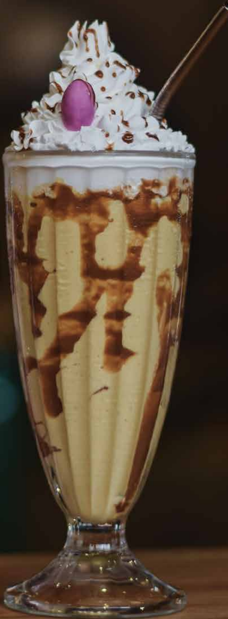
Mango pebbles milkshake