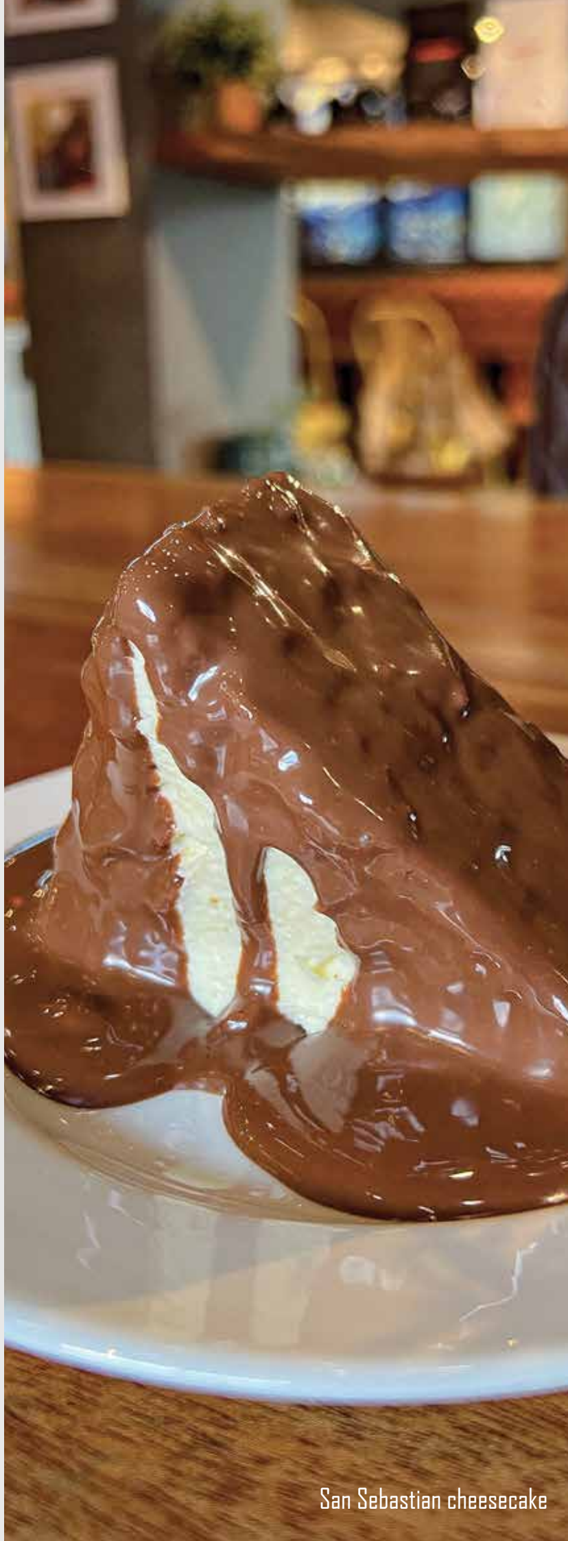
San Sebastian cheesecake

Extra Hazelnut chocolate sauce 55 Extra Pistachio cream 60